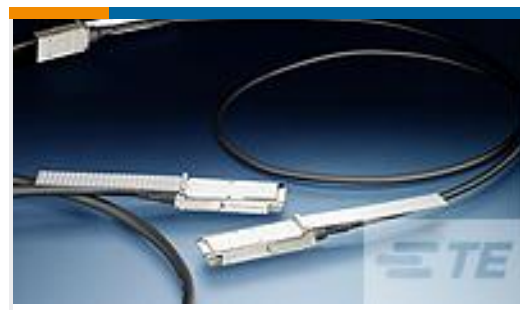
TE Part # 2202165-4 QSFP TO QSFP, 26AWG, FDR, 4.0 METER