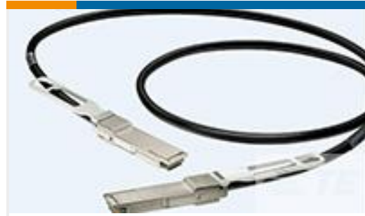
TE Part # 2829040-6 QSFP IB EDR, 30AWG, 2.0M