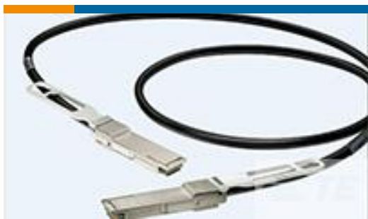
TE Part # 2829040-8 QSFP IB EDR, 26AWG, 3.0M