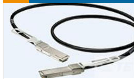
TE Part # 2829040-7 QSFP IB EDR, 26AWG, 2.0M