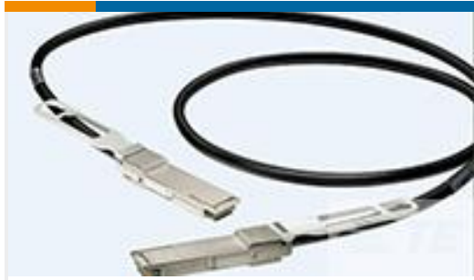
TE Part # 2829040-2 QSFP IB EDR, 33AWG, 1.0M