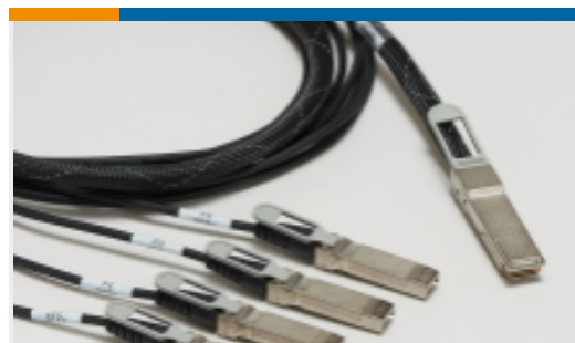
TE Part # 2821033-8 QSFP TO [4]SFP+, 28G, 1M, 33AWG