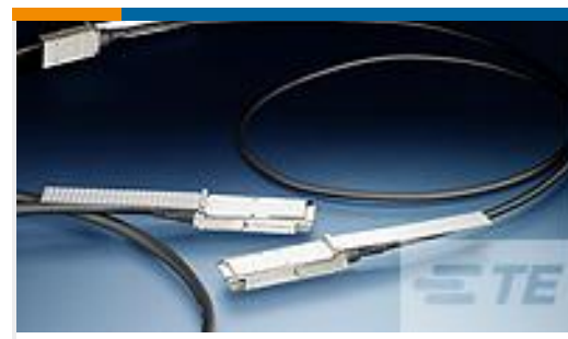
TE Part # 2202165-5 QSFP TO QSFP, 26AWG, FDR, 5.0 METER