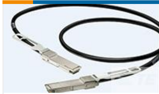
TE Part # 2829040-4 QSFP IB EDR, 30AWG, 1.0M