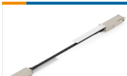
TE Part # 2053638-4 C/A, QSFP, 4M, P1-P2, UNEQUALIZED