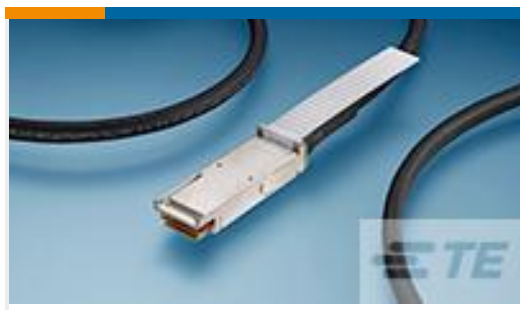
TE Part # 1-2220639-3 QSFP TO QSFP, ACTIVE, 28AWG, 13M